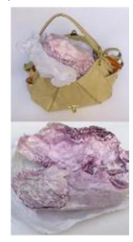
(Padding for boxes)