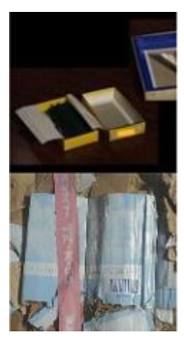
(incense stick and Softening Detergent Boxes)