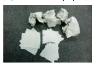
Teared Paper and Rolled paper (Spread rolled paper)