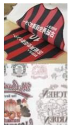
(Iron print paper)