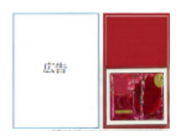
(Inserted Fliers of newspaper)