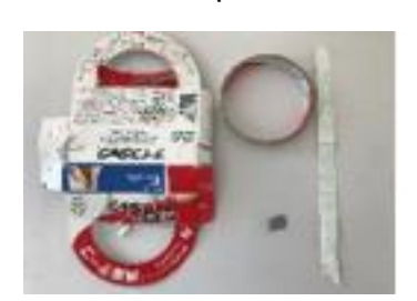
Packaging Paper and Cores for Double-sided Tapes